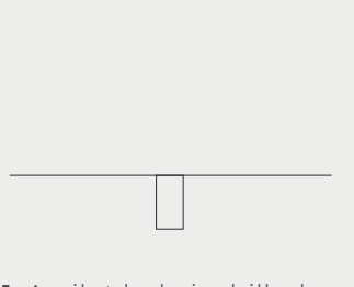
1. A pilot hole is drilled and a tapped metal plug is fixed in the deck.

The sea fastening is screwed into the deck which then allows the foot of the equipment to securely sit inside.