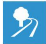
Outdoors (Exergame) Equipment: Upright Bike, Recline Bike, Treadmill, Climb