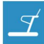
SKILLRUN Class (Exergame) Equipment: Treadmill