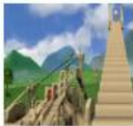
Infinity Stairs (Exergame) Equipment: Climb