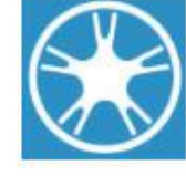
Group Cycle Class